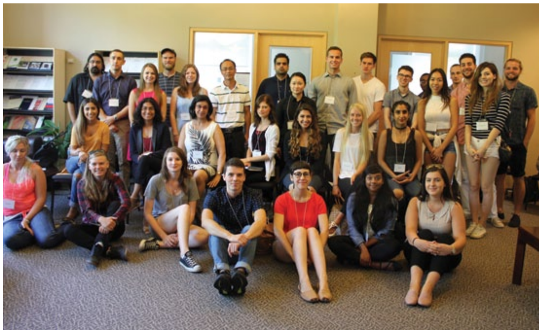
The 2016-2017 Master's Program Class