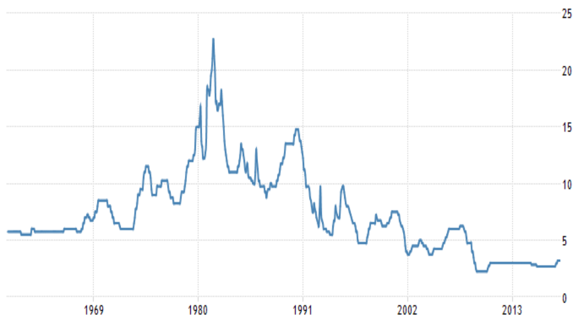
CANADA CHARTERED BANKS PRIME LENDING RATE

SOURCE: TRADINGECONOMICS.COM | BANK OF CANADA