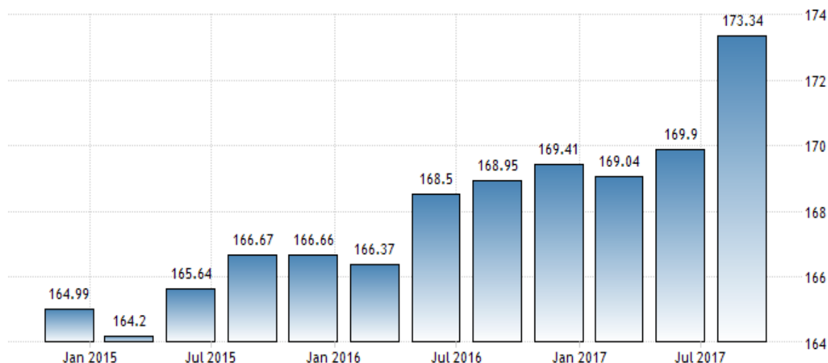
CANADA HOUSEHOLDS DEBT TO DISPOSABLE INCOME