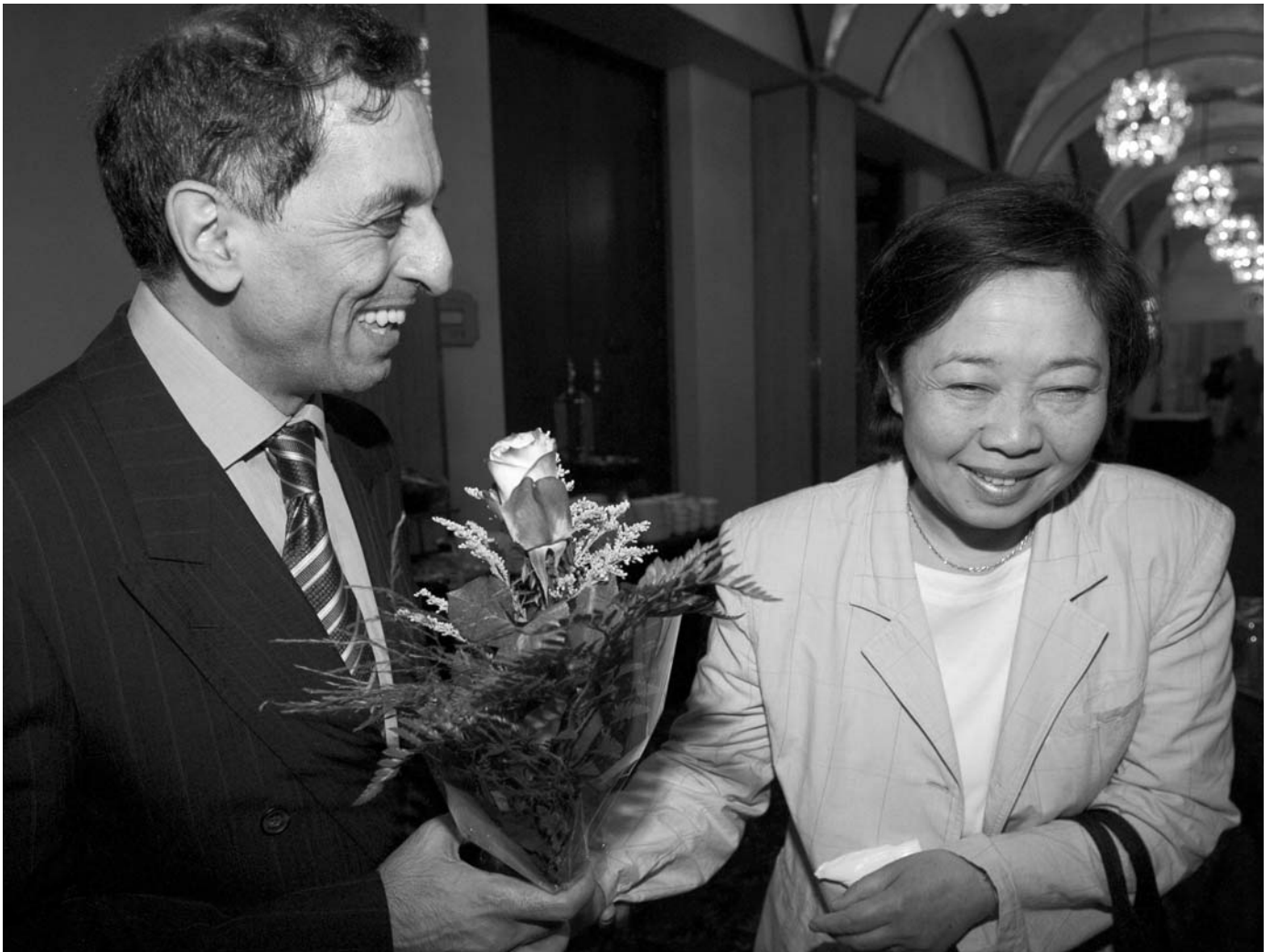
The Gazette, Montreal

Political leaders in Quebec have remained tight-lipped, but the political stakes for the Liberal government in Quebec, suffering in public opinion polls as never before, could not be greater. On the one hand, such a decision could be an unmitigated disaster, proving to Quebecers the incapacity of their provincial government to protect their collective rights to public health care against incursions from a federal institution. On the other hand, the popular Quebec minister of health and social services, Dr. Philippe Couillard, could emerge as a champion of Quebec's health care system. And in some circles, depending on who you talk to, another silver lining is that the