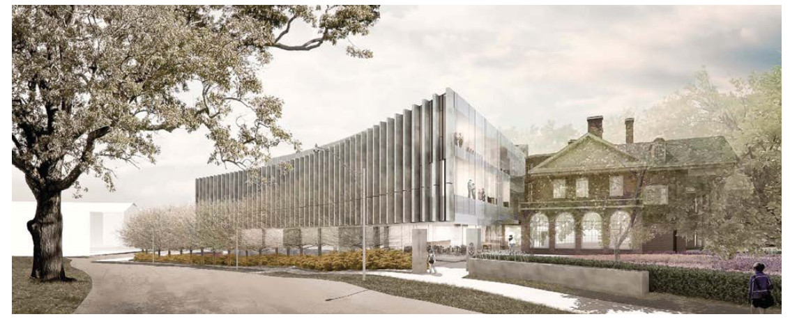
JACKMAN LAW BUILDING, OPENING 2015-16